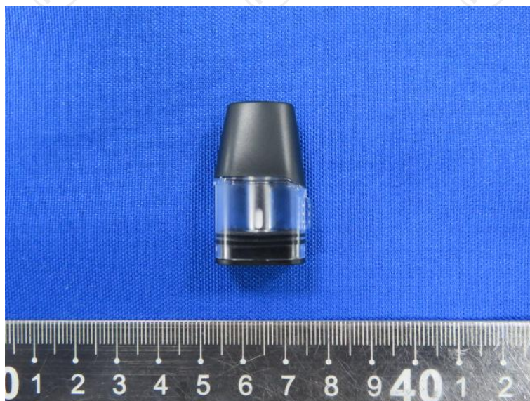
Geekvape One kit 1.2ohm FeCrAl (8-12W)